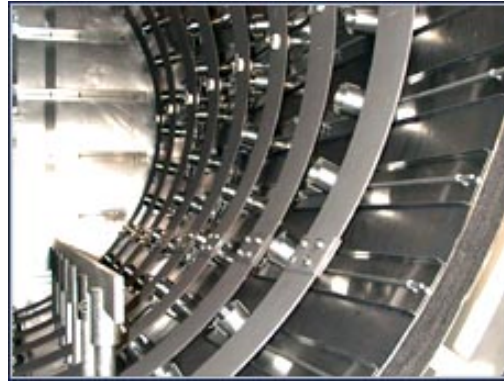
Lightweight Curved Graphite